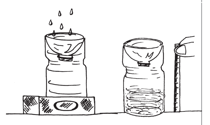
8. You can periodically measure the rainfall with the help of a ruler.