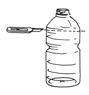
1. Take a 1-litre plastic water bottle. With a sharp knife cut its neck on the cylindrical part.

Using a plastic throw away water bottle you can make a very simple rain gauge. It costs almost nothing to make this nice apparatus.